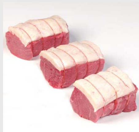
7. Secure with elasticated roasting bands.