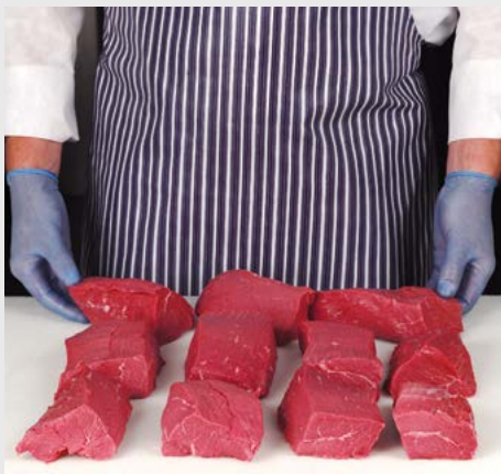
5. Cut into mini joints.