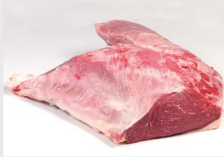
2. Boneless untrimmed silverside anterior view.