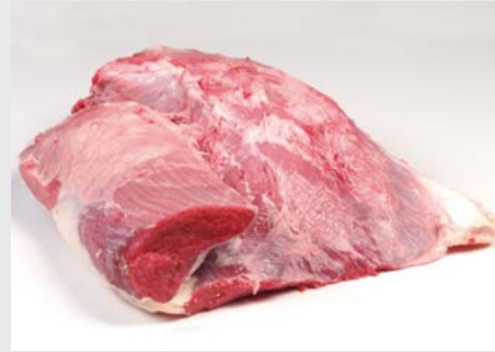
3. Boneless untrimmed silverside posterior view.