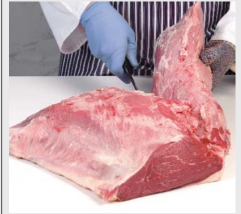
4. Remove the salmon cut from the rest of the silverside by cutting along the natural seam. Remove silverwall, excess fat and connective tissue.