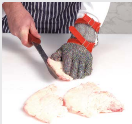
6. Add a 5mm layer of fat if required.